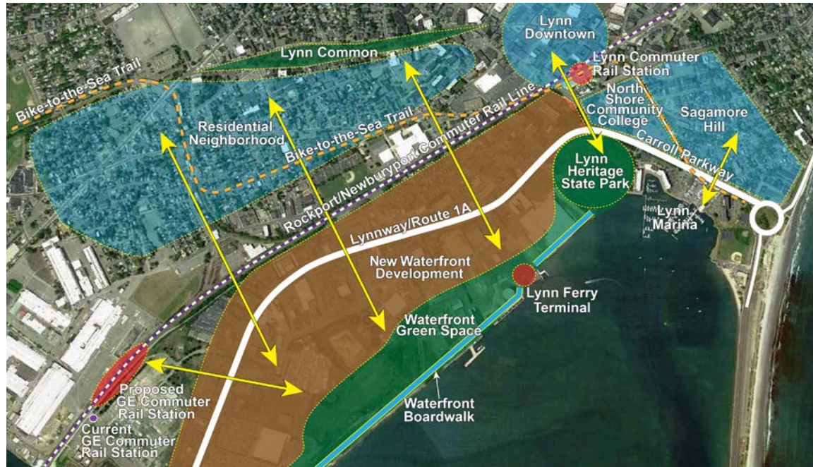
The study area of the Route 1A/Lynnway/Carroll Parkway Study.

Read the Route 1A/Lynnway/Carroll Parkway Study on the MPO's website ( http://www.bostonmpo.org/2015_priority_corridors .)