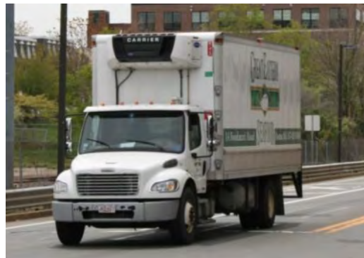
Entering on Bypass Road