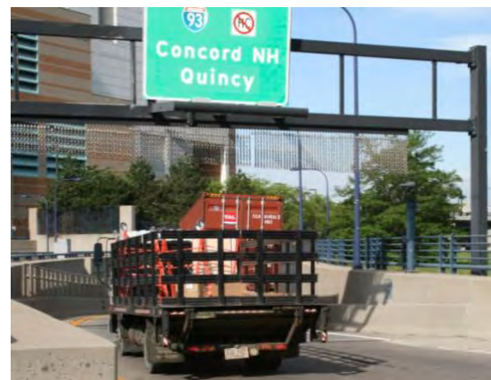
Exiting to I-93