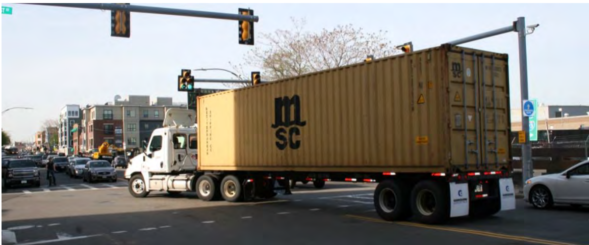
A 40-foot Ocean Container