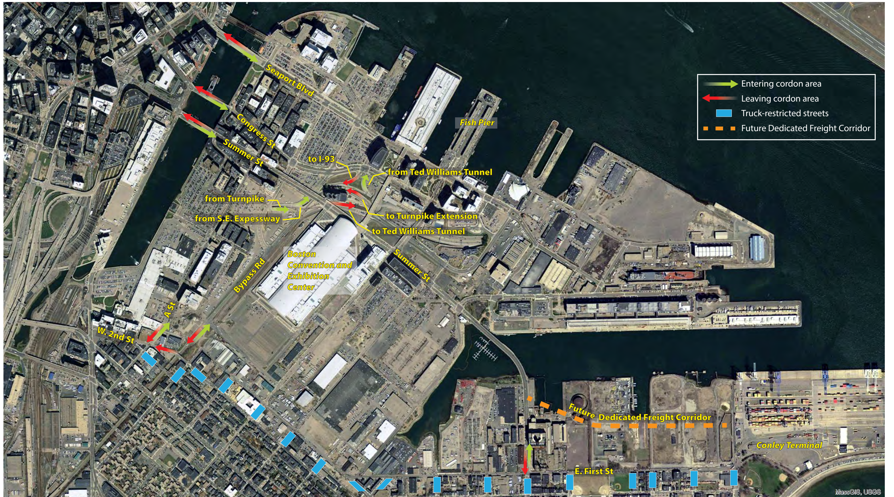
FIGURE 1 South Boston Waterfront Cordon Area