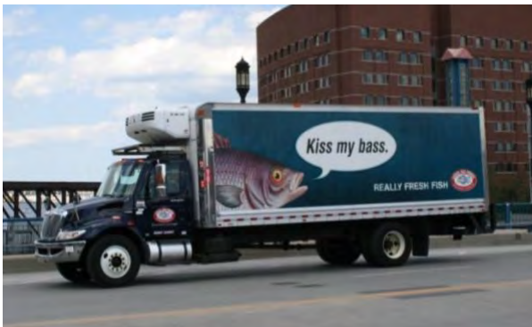
Leaving Cordon Area on Seaport Boulevard