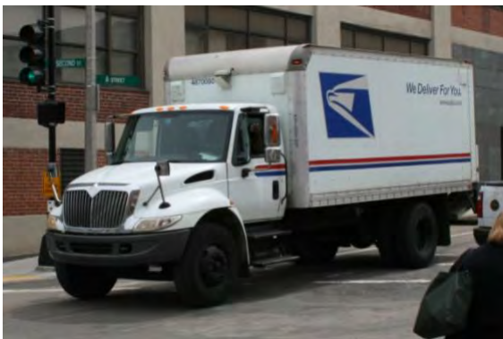
Entering Cordon Area on A Street