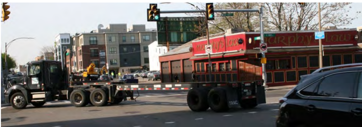
An Empty Chassis