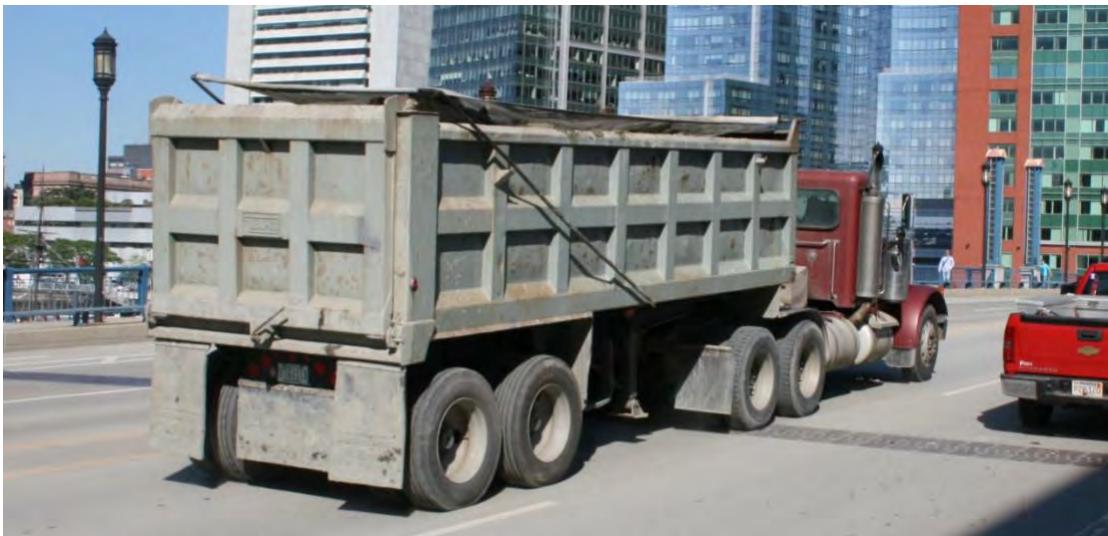
FIGURE 8 Semi-Trailer with Other Configuration

Leaving Cordon Area on Seaport Boulevard