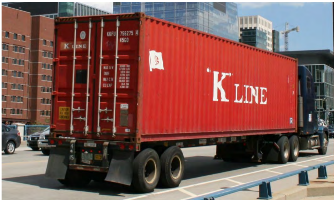
FIGURE 10 Ocean Shipping Container

Entering Cordon Area on Seaport Boulevard