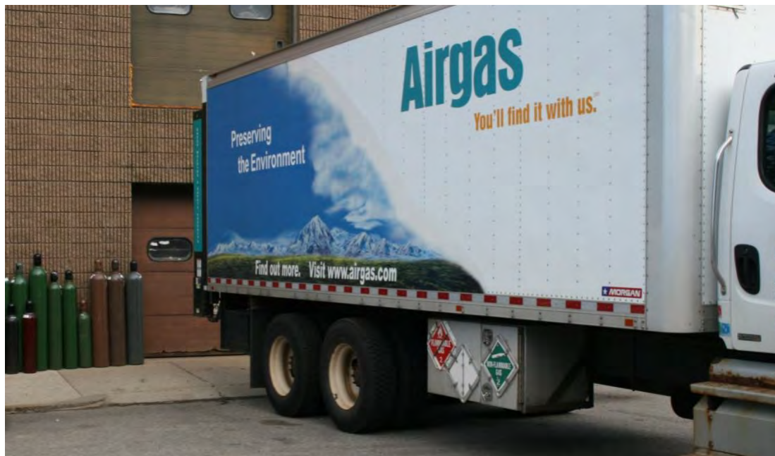
Welding Supply Distributor near the South Boston Waterfront