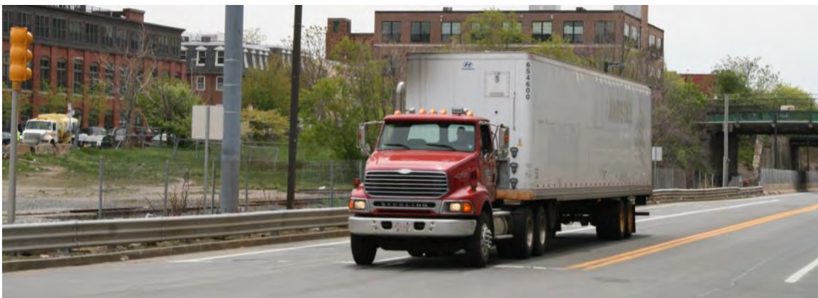
FIGURE 4 Box-Type Semi-Trailer (Unrefrigerated)

Entering Cordon Area on South Boston Bypass Road