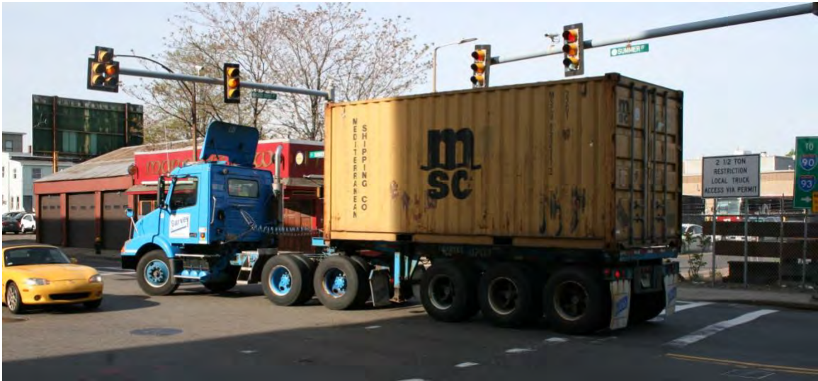
A 20-foot Ocean Container