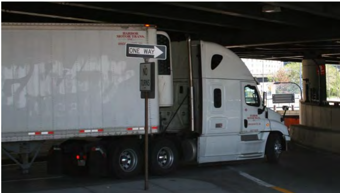
FIGURE 6 Refrigerated Semi-Trailer

Leaving Cordon Area via Ted Williams Tunnel