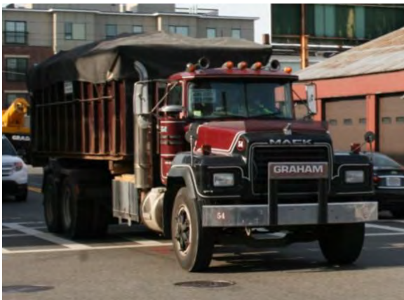
Entering on Summer St. at First St.