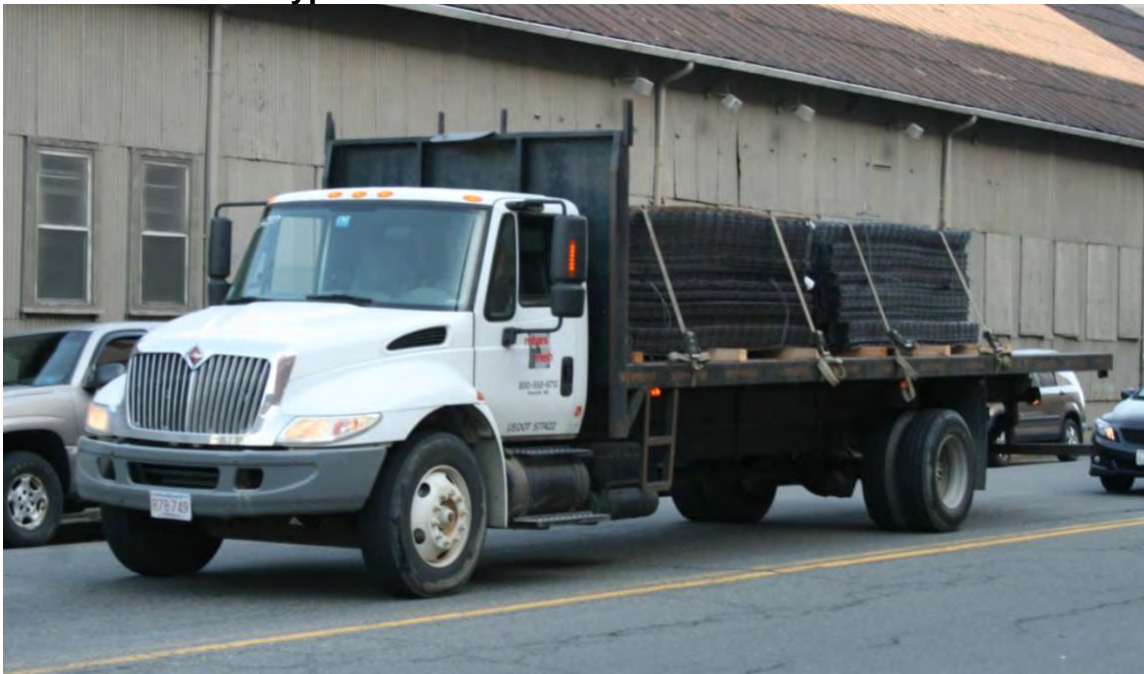
FIGURE 2 Typical Truck with Doubled Rear Wheels

Leaving cordon area on Summer Street near First Street