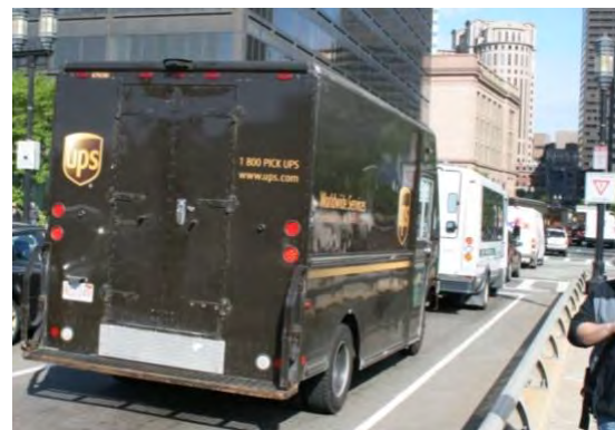
Leaving on Summer Street